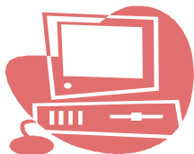
Online registration in Banner v7

These steps include Obtaining Registration Information & Academic Counseling, and then proceeding to Online Course Selection. At this point you are encouraged to obtain as much information as possible to enable you to select appropriate courses online based on your programme of study.